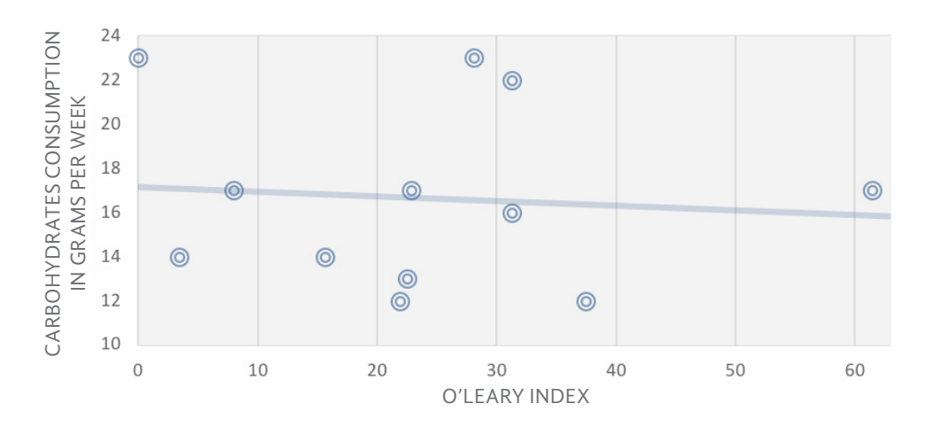
Graph 1. Correlation between the O'Leary index and the fermentable carbohydrates consumption