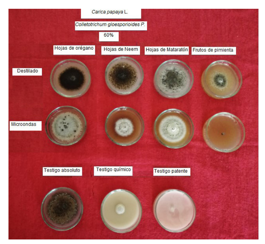
Image 1. In vitro effects of 60% plant extracts on Colletotrichum gloesporioides of C. papaya

The results obtained are shown in Table 1 and Image 1, where it can be seen that the treatments of pepper obtained by microwave and the M2 UNACH treatment were the only ones that did not allow the growth of the pathogen. The ANOVA performed indicated statistical differences between treatments for the variables growth and a total number of conidia. Tukey's test of means for the growth variable registered significant differences between pepper obtained by microwave and M2 patent, with all treatments including the positive control where the chemical synthesis product was used, which registered growth, as well as with the negative control, but this did not register differences with the extracts obtained from matarraton and oregano, obtained by the two methods and with neem obtained by distillation.