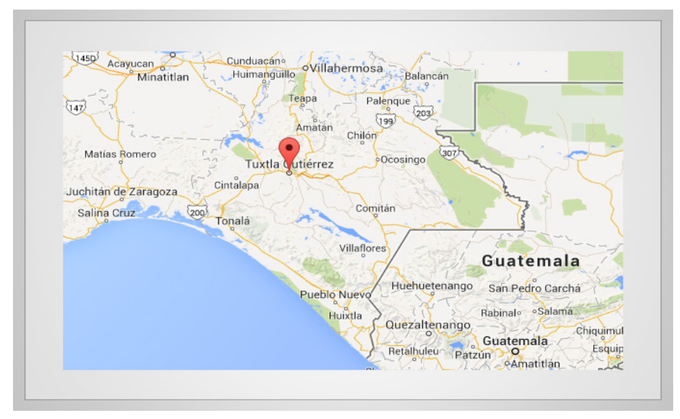
Figura 1. Google Maps: Venustiano Carranza, Chiapas, México.

Tuxtla Gutiérrez is the capital of the homonymous municipality and capital of the Mexican state of Chiapas. It is an urbanized city and has approximately 553 374 inhabitants (INEGI, 2013). Its growth and economic development has accelerated since the administrative centralization of government, the arrival of domestic and foreign capital investment brought to the city and increasing state economic development aid. The